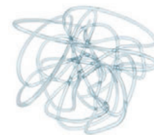
non cross-linked HA