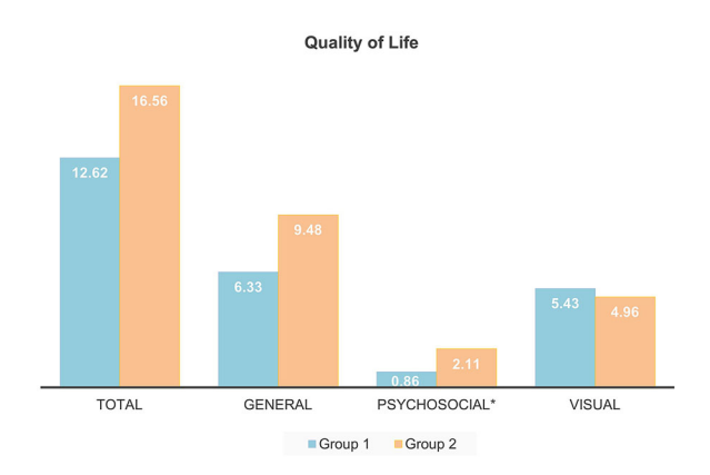
Fig. 2 Figure showing the mean quality of life in two different types of multifocal IOLs (Eyecryl and AcrySof). ^*p < 0.05

size was significantly different between groups 1 and 2 at low illumination (0.918 [0.905, 0.931] vs 1.154 [1.128, 1.180]; p = 0.004), but not at high illumination (1.009 [0.993, 1.026] vs 1.177 [1.162, 1.192]; p = 0.13).